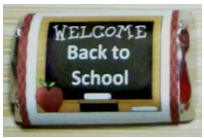
Miniature Candy Bar Wrappers