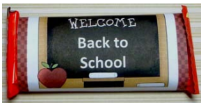
Snack Sized (.49 oz.) Candy Bar Wrappers