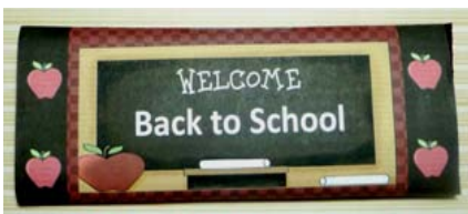
Regular (1.55 oz.) Candy Bar Wrappers